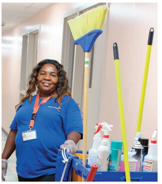
We clean over 5 million sq.ft. of space in over 120 government buildings.