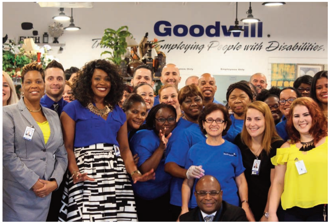
We have 36 Stores & 53 attended donation centers made possible by your donations that are sold and used to fund programs.

The Goodwill Laundry Services was created to initiate more jobs in the Liberty city area. It is a state-of-the-art facility that is automated, energy-efficient and environmentally green. We currently process 36 million lbs/yr and created 235 jobs.