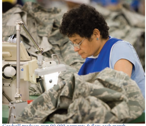
Goodwill produces over 90,000 garments & flags each month.