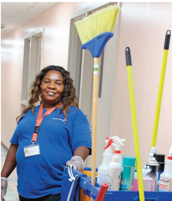
We clean over 5 million sq.ft. of space in over 120 government buildings.