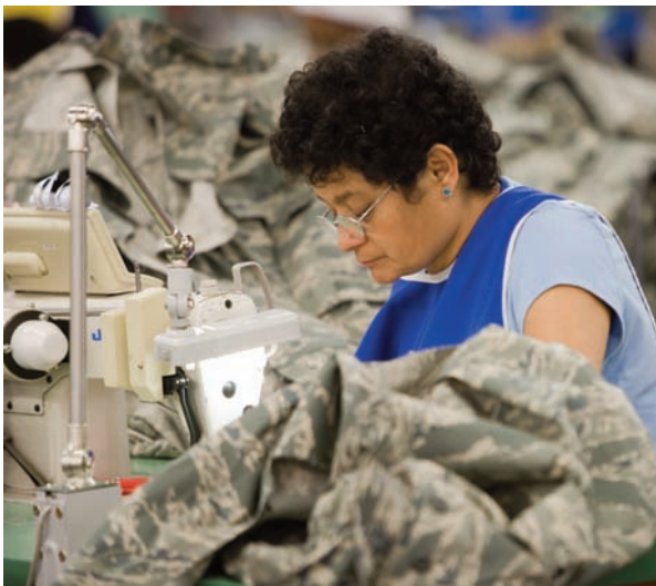
Goodwill produces over 90,000 garments & flags each month.